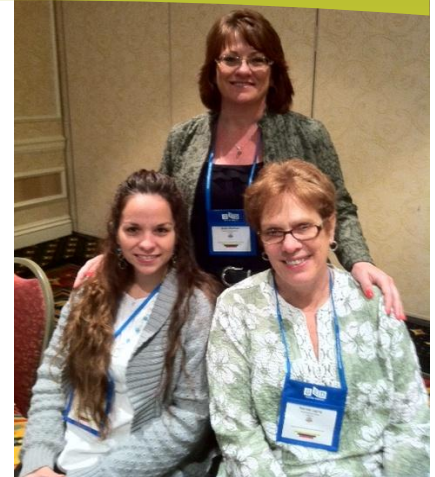
Representatives from Arkansas attending the national COABE conference.

The GED Testing Service® shared information on the current progress and continuing implementation of offering the GED® test on a computer-based platform and the new assessment system being released in 2014. Discussion included several facets of the new assessment system development including test-taker preparation and instruction.